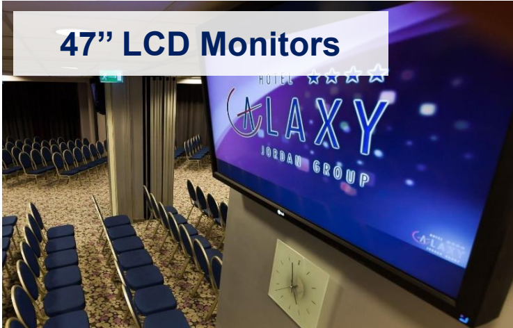
47" LCD Monitors