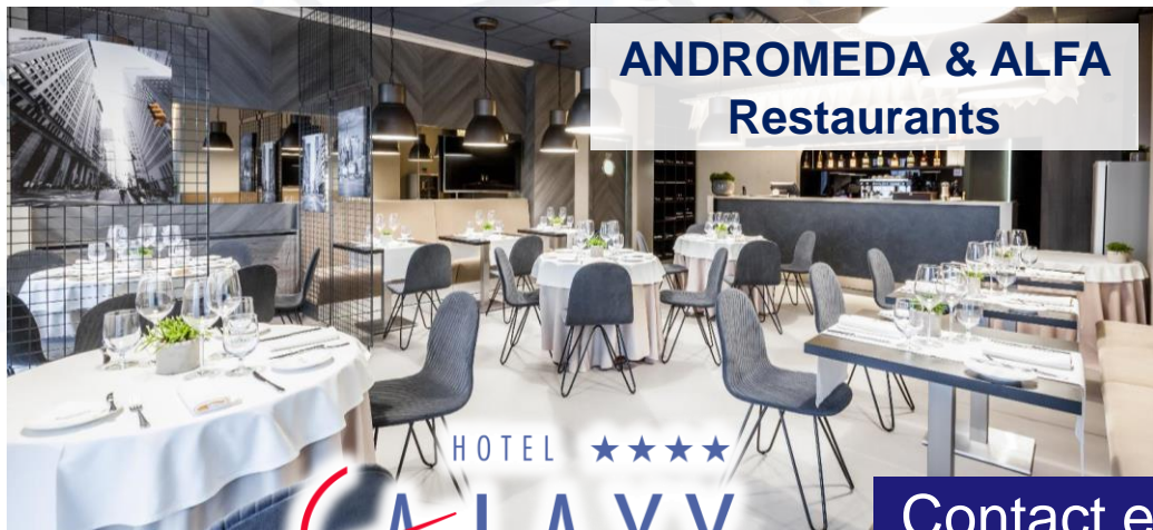
ANDROMEDA & ALFA Restaurants