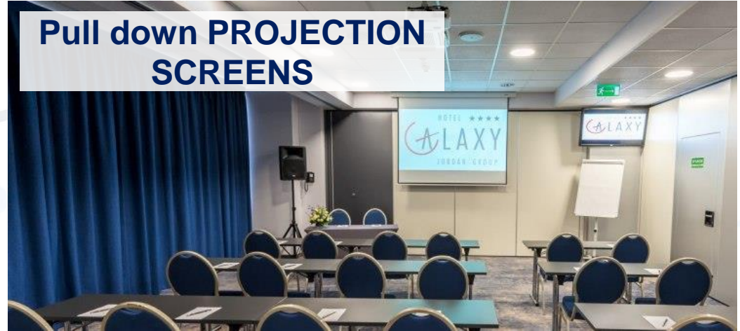
Pull down PROJECTION SCREENS